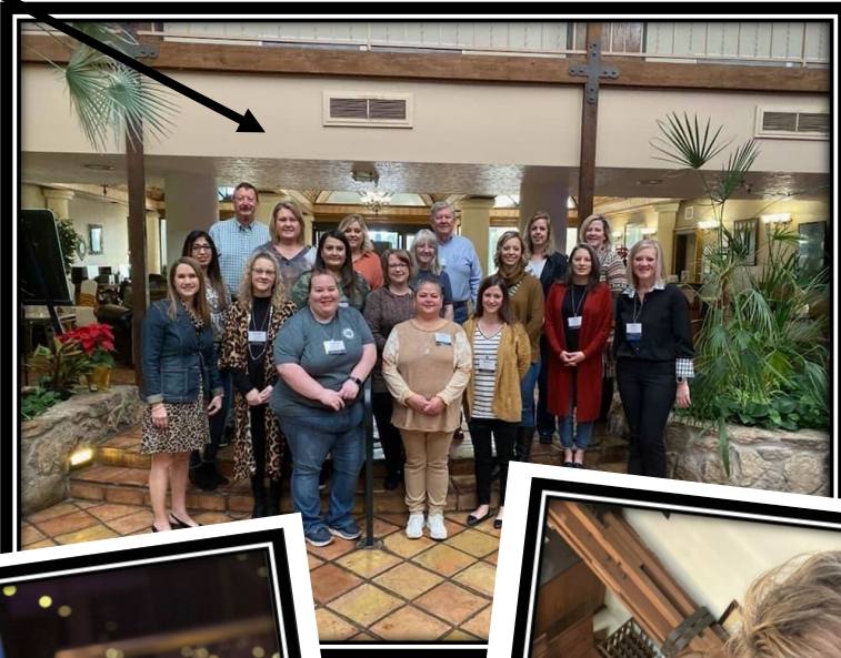
Attendees of the New Treasurer's School

Spring Conference Fun Walk in San Marcos