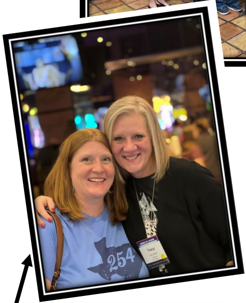
Risk Management Conference. Round Rock