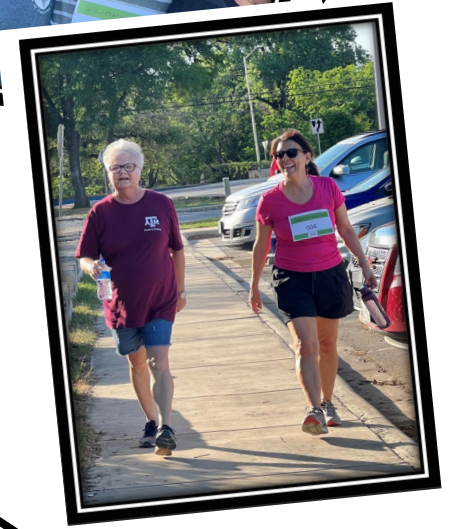
Leadership 254 Graduates